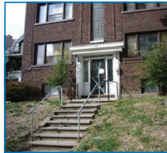
Figure 1- 164 Park South, no COA posting and glass door taped in place

See pictures taken showing that these properties are joined.