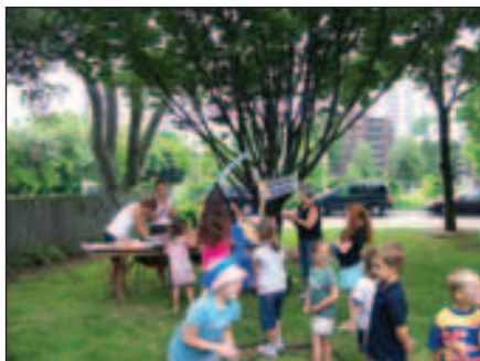
Midsummer fun in Durand Park!