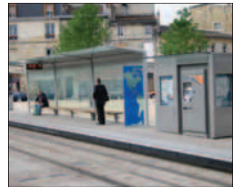
Coming soon to Hamilton?

The bottom line: the City's condition of zero City funding for LRT is a deal killer. If this is simply the City's opening negotiating position, that's fair enough. But then the City needs to communicate some flexibility. So far, that hasn't happened. Everything I've heard suggests